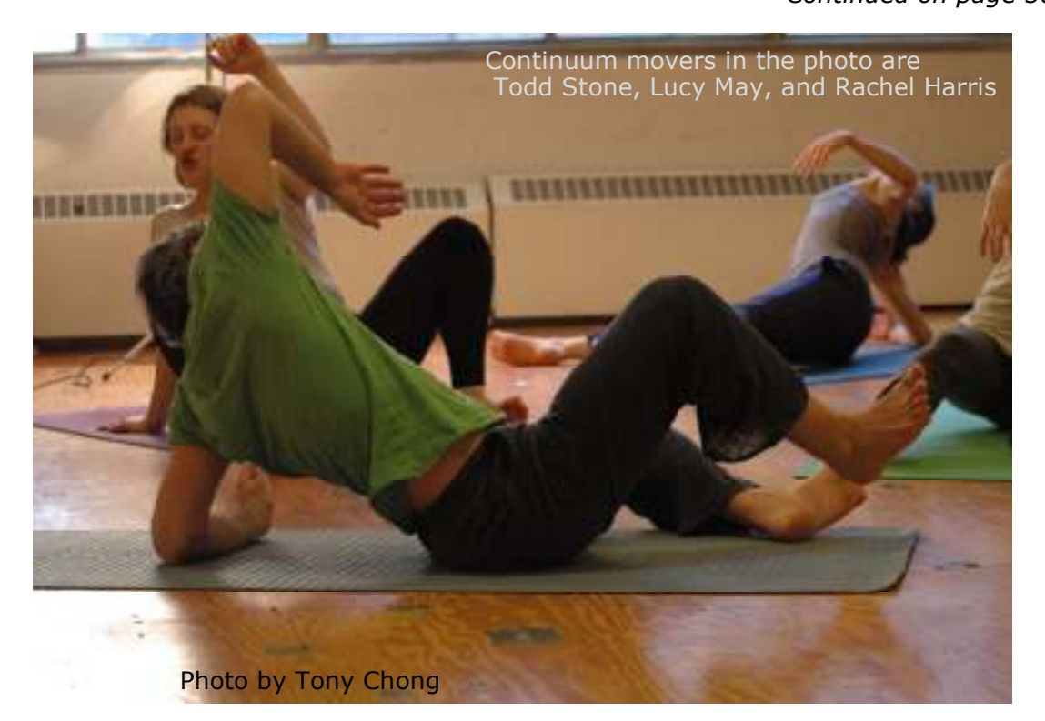
Somatic Psychotherapy Today | Fall 2016 | Volume 6, Number 3 | page 49

As a practitioner of somatic psychology, dance movement therapy, yoga therapy and Continuum Movement, it seems clear to me that Continuum is truly, at its core, a non-verbal approach to therapeutic intervention. It is difficult to describe this fluid, open-ended movement practice in words. Continuum invites our bodies to move in response to sound (including silence); sound and movement exist on the same continuum; that's why we can hear a hummingbird's flight. Continuum teaches the increasingly valued skill of interoception through a practice called 'open attention'. If one considers that life is embodied and that our human bodies are where we think, feel, act and sense, then it may not seem a stretch to consider that a principle that applies to ultrasound therapy also applies to the broader human embodied experience. Continued on page 50